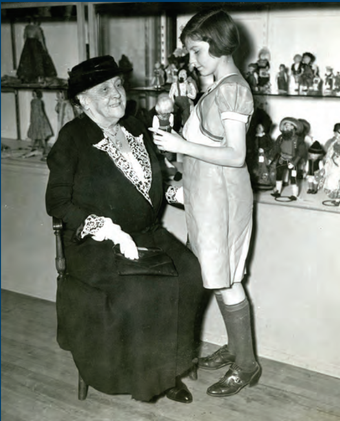
Left: In 1936, President Franklin Roosevelt's mother, Sara Roosevelt, attended a "Dolls of the World" benefit to support VNS Health.