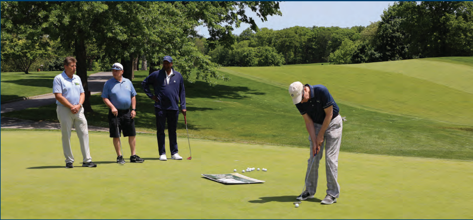
Above: In 2022, after two pandemic years on the sidelines, VNS Health's annual Golf Classic was back as a full-scale, in-person event. The May 23rd sold-out fundraiser brought together 120 golfers in the glorious spring air of the Wykagyl Country Club in New Rochelle, New York and raised over $290,000 for VNS Health's Veterans program.