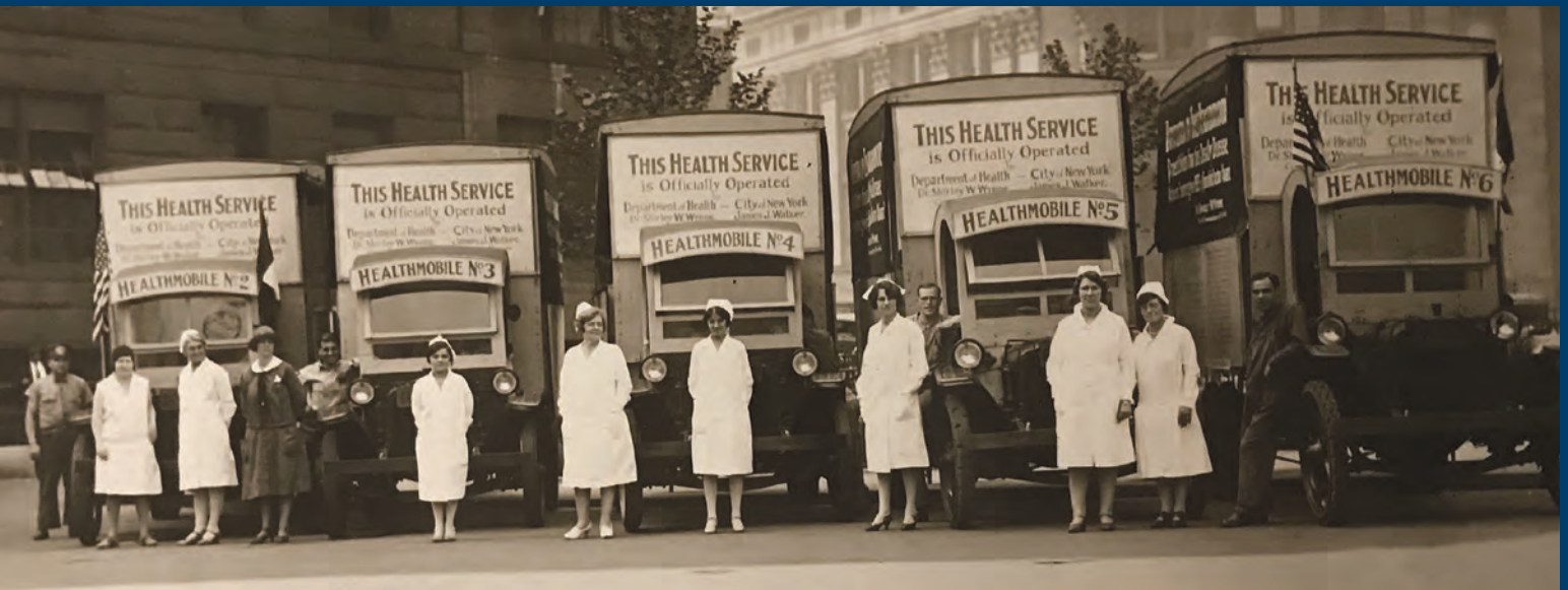
VNS Health nurses help staff New York City's Healthmobiles in an effort to halt the city's diphtheria epidemic in 1928.

Since our founding, VNS Health has been on the front lines of every public health crisis New York City has faced. From diphtheria to AIDS, and from Superstorm Sandy to COVID-19, in times of crisis we mobilize with courage and compassion. Being a part of the community, we are often among the first to reach and care for homebound, elderly and otherwise vulnerable residents.