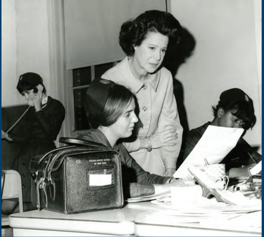
Actress and singer Kitty Carlisle Hart was a VNS Health supporter. Here she is visiting a district office in November, 1968.

For over 125 years, donors and philanthropy have played a key role in helping VNS Health provide care to the most vulnerable New Yorkers.