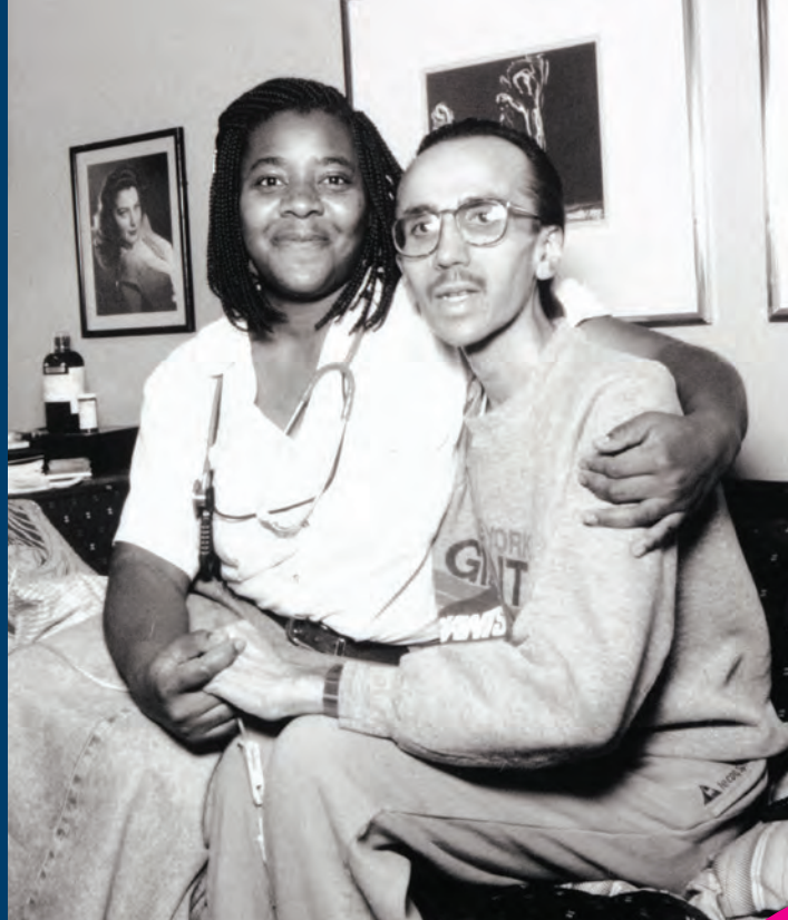
Above: A VNS Health nurse with an AIDS patient who she’d been helping to learn how to prepare and infuse his medications at home in 1991.