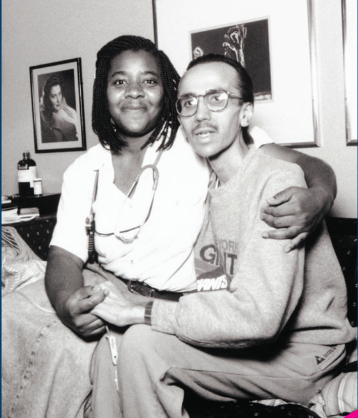
Above: A VNS Health nurse with an AIDS patient who she’d been helping to learn how to prepare and infuse his medications at home in 1991.