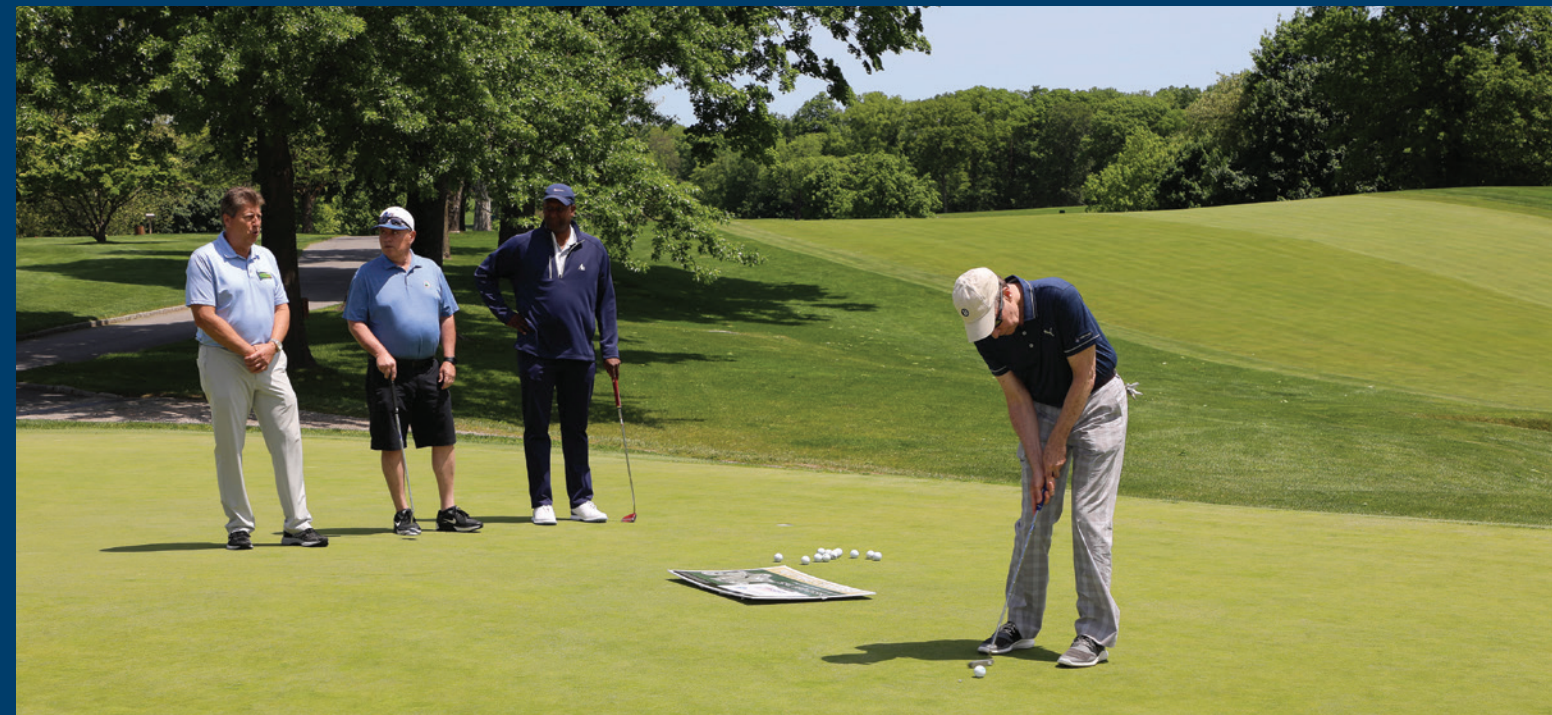
Above: In 2022, after two pandemic years on the sidelines, VNS Health's annual Golf Classic was back as a full-scale, in-person event. The May 23rd sold-out fundraiser brought together 120 golfers in the glorious spring air of the Wykagyl Country Club in New Rochelle, New York and raised over $290,000 for VNS Health's Veterans program.