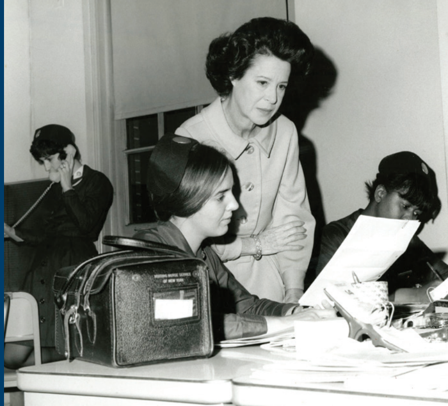
Actress and singer Kitty Carlisle Hart was a VNS Health supporter. Here she is visiting a district office in November, 1968.

For over 125 years, donors and philanthropy have played a key role in helping VNS Health provide care to the most vulnerable New Yorkers.