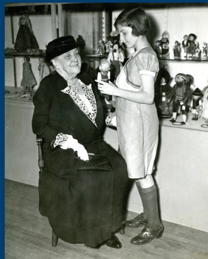
Left: In 1936, President Franklin Roosevelt's mother, Sara Roosevelt, attended a "Dolls of the World" benefit to support VNS Health.