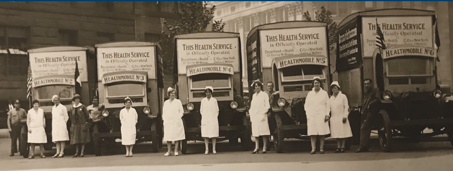
VNS Health nurses help staff New York City’s Healthmobiles in an effort to halt the city’s diphtheria epidemic in 1928.

Since our founding, VNS Health has been on the front lines of every public health crisis New York City has faced. From diphtheria to AIDS, and from Superstorm Sandy to COVID-19, in times of crisis we mobilize with courage and compassion. Being a part of the community, we are often among the first to reach and care for homebound, elderly and otherwise vulnerable residents.