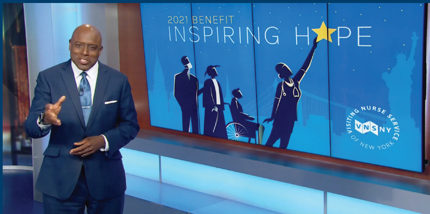
VNS Health's 2021 virtual Benefit Gala raised over $1.4 million for our Charitable Care and Community Impact programs and VNS Health's Coronavirus Response Fund.